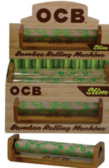
OCB® BAMBOO SLIM ROLLING MACHINE ITEM BP110 6 EA | 6 UN | 36 CA