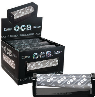
OCB® CLASSIC 1 1/4 CONE ROLLER ROLLING MACHINE WITH SPACER ITEM OC079C 6 EA | 6 UN | 36 CA