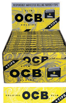
OCB® SOLAIRE® SLIM + TIPS | 32 LEAVES WOOD FIBERS | CLASSIC WHITE ITEM OSLKS 24 EA | 20 UN | 480 CA