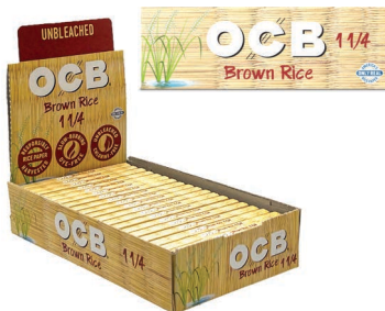
OCB® BROWN RICE 1 1/4 | 50 LEAVES RICE FIBERS | UNBLEACHED ITEM OR114 24 EA | 40 UN | 960 CA