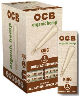
OCB® ORGANIC HEMP CONES KING | 3 PACK 100% HEMP FIBERS | UNBLEACHED ITEM CNOOH109 24 EA | 20 UN | 480 CA