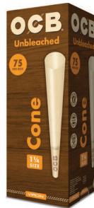
OCB® UNBLEACHED CONES 1 1/4 | 75 COUNT 100% WOOD FIBERS | UNBLEACHED ITEM OVC14T7 1 EA | - UN | 30 CA