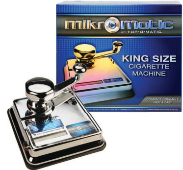
MIKROMATIC® BY TOP-O-MATIC® KING MANUAL CIGARETTE MACHINE ITEM BGN0B 1 EA | - UN | 6 CA