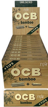
OCB® BAMBOO 1 1/4 + TIPS | 50 LEAVES 100% BAMBOO FIBERS | UNBLEACHED ITEM OCTP14BB 24 EA | 20 UN | 480 CA