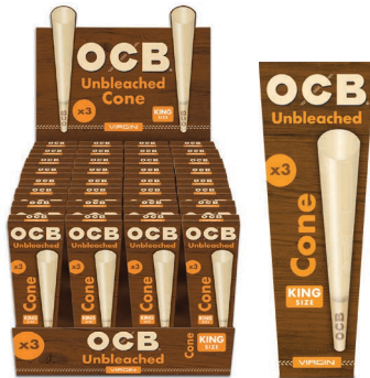
OCB® UNBLEACHED CONES KING | 3 PACK 100% WOOD FIBERS | UNBLEACHED ITEM OCCNKSVR 32 EA | 24 UN | 768 CA