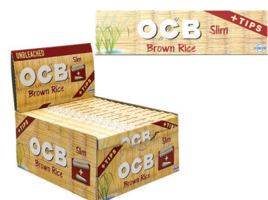
OCB® BROWN RICE SLIM + TIPS | 32 LEAVES RICE FIBERS | UNBLEACHED ITEM OCTPKSRC 24 EA | 20 UN | 480 CA