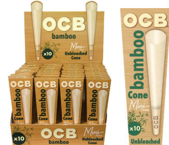
OCB® BAMBOO CONES MINI | 10 PACK 100% BAMBOO FIBERS | UNBLEACHED ITEM OB70CN 32 EA | 24 UN | 768 CA