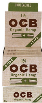
OCB® ORGANIC HEMP 1 1/4 + TIPS | 50 LEAVES 100% HEMP FIBERS | UNBLEACHED ITEM OCTP12OH 24 EA | 20 UN | 480 CA