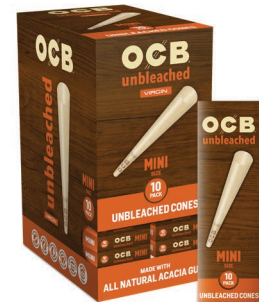
OCB® UNBLEACHED CONES MINI | 10 PACK 100% WOOD FIBERS | UNBLEACHED ITEM CNOUB70 24 EA | 20 UN | 480 CA