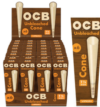
OCB® UNBLEACHED CONES 1 1/4 | 6 PACK 100% WOOD FIBERS | UNBLEACHED ITEM OCCN14VR 32 EA | 24 UN | 768 CA