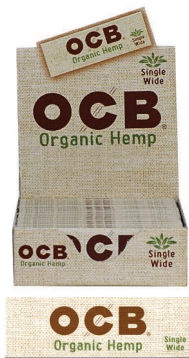
OCB® ORGANIC HEMP SINGLE WIDE | 50 LEAVES 100% HEMP FIBERS | UNBLEACHED ITEM OOHSW 24 EA | 40 UN | 960 CA