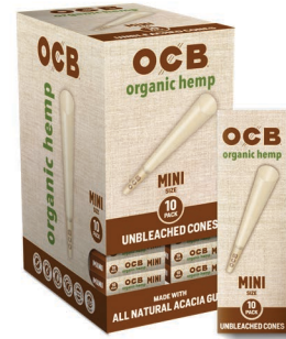
OCB® ORGANIC HEMP CONES MINI | 10 PACK 100% HEMP FIBERS | UNBLEACHED ITEM CNOOH70 24 EA | 20 UN | 480 CA