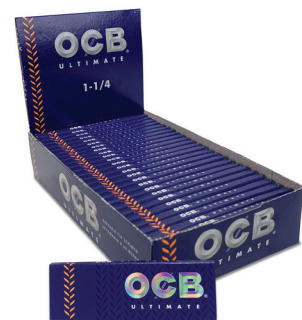
OCB® ULTIMATE 1 1/4 | 50 LEAVES WOOD FIBERS | CLASSIC WHITE ITEM OC14ULFR 25 EA | 40 UN | 1000 CA