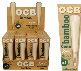
OCB® BAMBOO CONES KING | 3 PACK 100% BAMBOO FIBERS | UNBLEACHED ITEM OBKSCN 32 EA | 24 UN | 768 CA