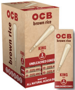
OCB® BROWN RICE CONES KING | 3 PACK RICE FIBERS | UNBLEACHED ITEM CNOBR109 24 EA | 20 UN | 480 CA