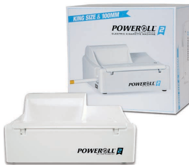
POWERROLL® 2 BY TOP-O-MATIC® KING & 100MM ELECTRIC CIGARETTE MACHINE ITEM PR002 1 EA | - UN | 4 CA