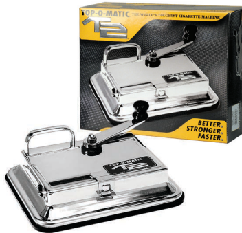
T2® BY TOP-O-MATIC® KING & 100MM MANUAL CIGARETTE MACHINE ITEM T2MAC 1 EA | - UN | 6 CA