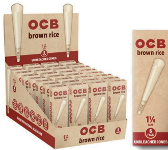
OCB® BROWN RICE CONES 1 1/4 | 6 PACK RICE FIBERS | UNBLEACHED ITEM OR114CN 32 EA | 24 UN | 768 CA