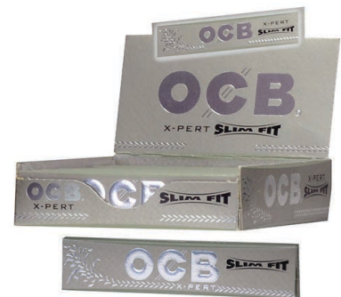
OCB® X-PERT SLIM | 32 LEAVES WOOD FIBERS | CLASSIC WHITE ITEM OXKSS 24 EA | 40 UN | 960 CA