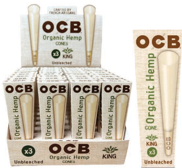
OCB® ORGANIC HEMP CONES KING | 3 PACK 100% HEMP FIBERS | UNBLEACHED ITEM CNKSOHO 32 EA | 24 UN | 768 CA