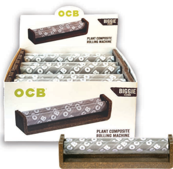
OCB® PLANT COMPOSITE BIGGIE 125MM ROLLING MACHINE ITEM WP125 6 EA | 6 UN | 36 CA