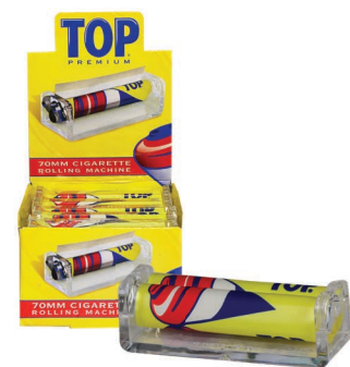
TOP® PREMIUM SINGLE WIDE ROLLING MACHINE ITEM TROLL 12 EA | 24 UN | 288 CA