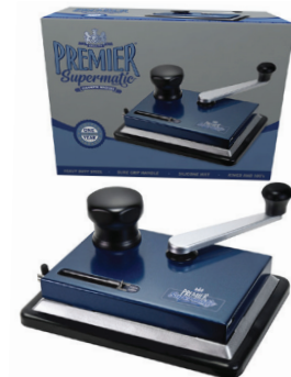
PREMIER® SUPERMATIC® KING & 100MM MANUAL CIGARETTE MACHINE ITEM 00111 1 EA | - UN | 6 CA