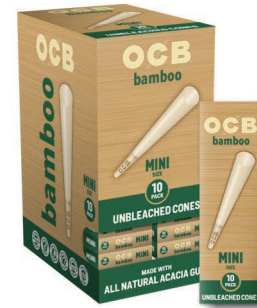
OCB® BAMBOO CONES MINI | 10 PACK 100% BAMBOO FIBERS | UNBLEACHED ITEM CNOBB70 24 EA | 20 UN | 480 CA