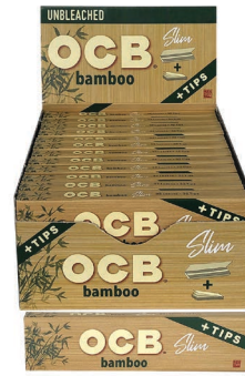
OCB® BAMBOO SLIM + TIPS | 32 LEAVES 100% BAMBOO FIBERS | UNBLEACHED ITEM OCTPKSBB 24 EA | 20 UN | 480 CA