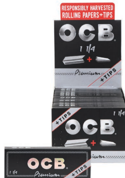
OCB® PREMIUM 1 1/4 + TIPS | 50 LEAVES WOOD FIBERS | CLASSIC WHITE ITEM OCTP14PM 24 EA | 20 UN | 480 CA