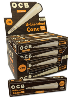
OCB® UNBLEACHED CONES 1 1/4 | 32 PACK 100% WOOD FIBERS | UNBLEACHED ITEM 32OV14CN 12 EA | 24 UN | 288 CA