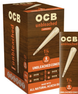
OCB® UNBLEACHED CONES 1 1/4 | 6 PACK 100% WOOD FIBERS | UNBLEACHED ITEM CNOUB84 24 EA | 20 UN | 480 CA