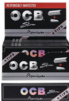
OCB® PREMIUM SLIM + TIPS | 32 LEAVES WOOD FIBERS | CLASSIC WHITE ITEM OCTPKSPM 24 EA | 20 UN | 480 CA