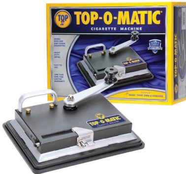
TOP-O-MATIC® KING & 100MM MANUAL CIGARETTE MACHINE ITEM TMACH 1 EA | - UN | 6 CA