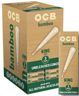
OCB® BAMBOO CONES KING | 3 PACK 100% BAMBOO FIBERS | UNBLEACHED ITEM CNOBB109 24 EA | 20 UN | 480 CA