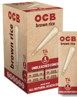
OCB® BROWN RICE CONES 1 1/4 | 6 PACK RICE FIBERS | UNBLEACHED ITEM CNOBR84 24 EA | 20 UN | 480 CA