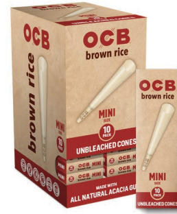
OCB® BROWN RICE CONES MINI | 10 PACK RICE FIBERS | UNBLEACHED ITEM CNOBR70 24 EA | 20 UN | 480 CA