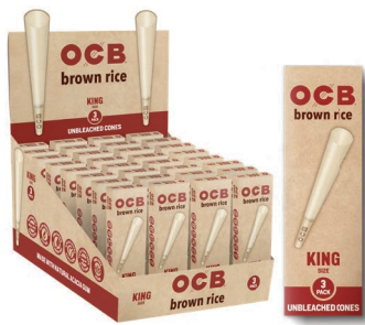
OCB® BROWN RICE CONES KING | 3 PACK RICE FIBERS | UNBLEACHED ITEM ORKSCN 32 EA | 24 UN | 768 CA