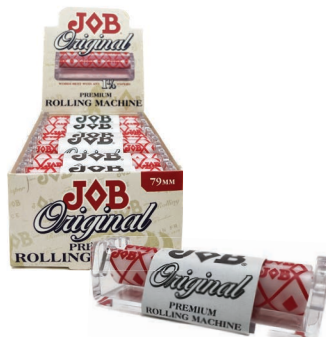
JOB® ORIGINAL 79MM ROLLING MACHINE ITEM JROLL 12 EA | 24 UN | 288 CA