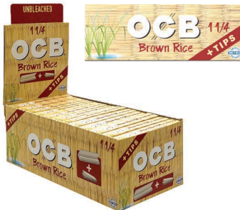
OCB® BROWN RICE 1 1/4 + TIPS | 50 LEAVES RICE FIBERS | UNBLEACHED ITEM OCTP14RC 24 EA | 20 UN | 480 CA