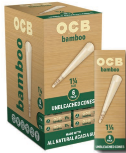
OCB® BAMBOO CONES 1 1/4 | 6 PACK 100% BAMBOO FIBERS | UNBLEACHED ITEM CNOBB84 24 EA | 20 UN | 480 CA