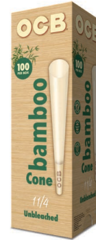
OCB® BAMBOO CONES 1 1/4 | 100 COUNT 100% BAMBOO FIBERS | UNBLEACHED ITEM OBC14T10 1 EA | - UN | 30 CA