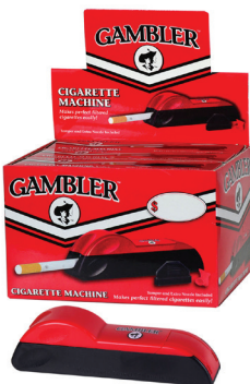
GAMBLER® KING HANDHELD CIGARETTE INJECTOR ITEM GMACH 6 EA | 4 UN | 24 CA