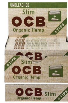
OCB® ORGANIC HEMP SLIM + TIPS | 32 LEAVES 100% HEMP FIBERS | UNBLEACHED ITEM OCTPKSOH 24 EA | 20 UN | 480 CA