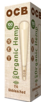
OCB® ORGANIC HEMP CONES 1 1/4 | 100 COUNT 100% HEMP FIBERS | UNBLEACHED ITEM OOH14T10 1 EA | - UN | 30 CA