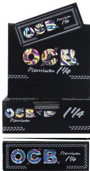
OCB® PREMIUM 1 1/4 | 50 LEAVES WOOD FIBERS | CLASSIC WHITE ITEM OP114 24 EA | 40 UN | 960 CA