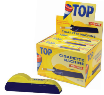
TOP® 100MM HANDHELD CIGARETTE INJECTOR ITEM T100M 6 EA | 4 UN | 24 CA