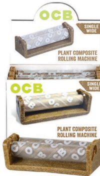
OCB® PLANT COMPOSITE SINGLE WIDE ROLLING MACHINE ITEM WP070 6 EA | 6 UN | 36 CA