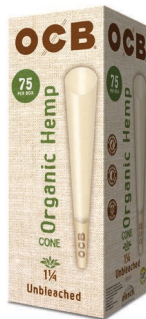
OCB® ORGANIC HEMP CONES 1 1/4 | 75 COUNT 100% HEMP FIBERS | UNBLEACHED ITEM OOH14T7 1 EA | - UN | 30 CA