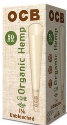
OCB® ORGANIC HEMP CONES 1 1/4 | 50 COUNT 100% HEMP FIBERS | UNBLEACHED ITEM OOH14T5 1 EA | - UN | 30 CA