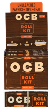
OCB® UNBLEACHED 1 1/4 ROLL KIT | 50 LEAVES 100% WOOD FIBERS | UNBLEACHED ITEM OV114RK 20 EA | 20 UN | 400 CA