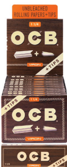
OCB® UNBLEACHED 1 1/4 + TIPS | 50 LEAVES 100% WOOD FIBERS | UNBLEACHED ITEM OCTP14VR 24 EA | 20 UN | 480 CA