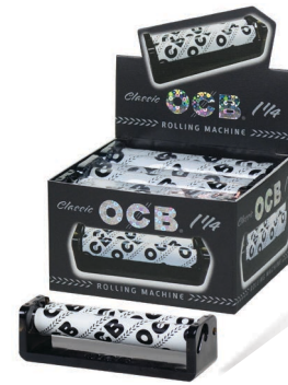
OCB® CLASSIC 1 1/4 ROLLING MACHINE ITEM OC079 6 EA | 6 UN | 36 CA