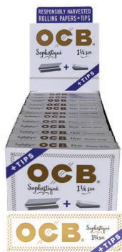
OCB® SOPHISTIQUE® 1 1/4 + TIPS | 50 LEAVES FLAX FIBERS | CLASSIC WHITE ITEM OSP12 24 EA | 20 UN | 480 CA