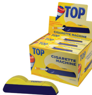
TOP® KING HANDHELD CIGARETTE INJECTOR ITEM TOPMA 6 EA | 4 UN | 24 CA