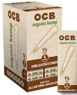
OCB® ORGANIC HEMP CONES 1 1/4 | 6 PACK 100% HEMP FIBERS | UNBLEACHED ITEM CNOOH84 24 EA | 20 UN | 480 CA