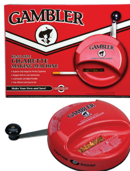
GAMBLER® KING MANUAL CIGARETTE MACHINE ITEM GTMA 1 EA | - UN | 6 CA