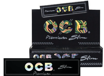
OCB® PREMIUM SLIM | 32 LEAVES WOOD FIBERS | CLASSIC WHITE ITEM OPKSS 24 EA | 40 UN | 960 CA