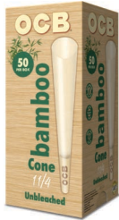
OCB® BAMBOO CONES 1 1/4 | 50 COUNT 100% BAMBOO FIBERS | UNBLEACHED ITEM OBC14T5 1 EA | - UN | 30 CA