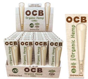
OCB® ORGANIC HEMP CONES MINI | 10 PACK 100% HEMP FIBERS | UNBLEACHED ITEM CN70OHO 32 EA | 24 UN | 768 CA