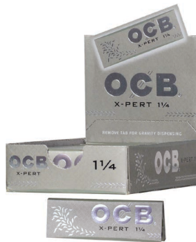
OCB® X-PERT 1 1/4 | 50 LEAVES WOOD FIBERS | CLASSIC WHITE ITEM OX114 24 EA | 40 UN | 960 CA