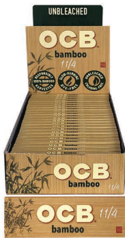
OCB® BAMBOO 1 1/4 | 50 LEAVES 100% BAMBOO FIBERS | UNBLEACHED ITEM OB114 24 EA | 40 UN | 960 CA