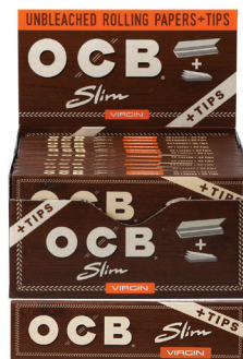
OCB® UNBLEACHED SLIM + TIPS | 32 LEAVES 100% WOOD FIBERS | UNBLEACHED ITEM OCTPKSVR 24 EA | 20 UN | 480 CA