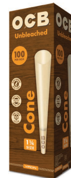
OCB® UNBLEACHED CONES 1 1/4 | 100 COUNT 100% WOOD FIBERS | UNBLEACHED ITEM OVC14T10 1 EA | - UN | 30 CA