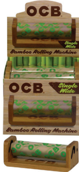
OCB® BAMBOO SINGLE WIDE ROLLING MACHINE ITEM BP070 6 EA | 6 UN | 36 CA