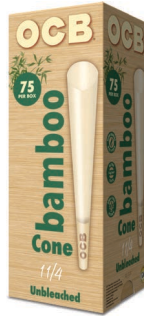
OCB® BAMBOO CONES 1 1/4 | 75 COUNT 100% BAMBOO FIBERS | UNBLEACHED ITEM OBC14T7 1 EA | - UN | 30 CA