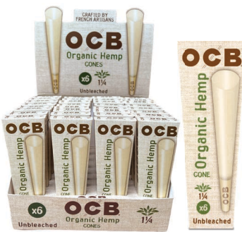
OCB® ORGANIC HEMP CONES 1 1/4 | 6 PACK 100% HEMP FIBERS | UNBLEACHED ITEM CN14OHO 32 EA | 24 UN | 768 CA