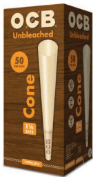
OCB® UNBLEACHED CONES 1 1/4 | 50 COUNT 100% WOOD FIBERS | UNBLEACHED ITEM OVC14T5 1 EA | - UN | 30 CA