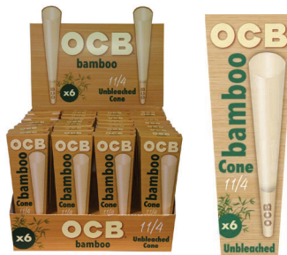
OCB® BAMBOO CONES 1 1/4 | 6 PACK 100% BAMBOO FIBERS | UNBLEACHED ITEM OB14CN 32 EA | 24 UN | 768 CA