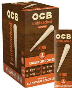
OCB® UNBLEACHED CONES KING | 3 PACK 100% WOOD FIBERS | UNBLEACHED ITEM CNOUB109 24 EA | 20 UN | 480 CA