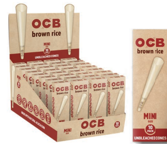
OCB® BROWN RICE CONES MINI | 10 PACK RICE FIBERS | UNBLEACHED ITEM OR70CN 32 EA | 24 UN | 768 CA