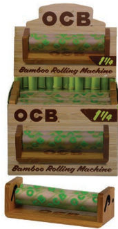
OCB® BAMBOO 1 1/4 ROLLING MACHINE ITEM BP079 6 EA | 6 UN | 36 CA